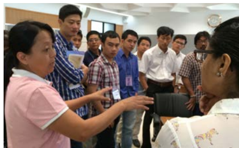
Figure 3: Lower Mekong CSO representative discuss equity at the second capacity development workshop

Earlier this year, the GREEN Mekong team met with partner CSOs to discuss capacity development needs. Based on this assessment a second regional workshop was organized in May this year. Representatives from 20 CSOs came together to participate in the workshop, which focused on enhancing skills in monitoring and evaluation, proposal writing and communication