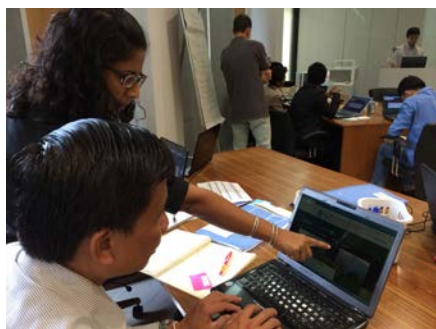
Figure 5: GREEN Mekong staff assisting CSO representatives to access the Grassroots Equity Portal

The online portal for the CSOs involved in the program on the RECOFTC website is now ready; contributions are solicited from all partners involved with the program to date. The portal, which is also open to climate change and CF practitioners, will feature updates from CSOs implementing the GMCF and showcase equity resources from across the globe. The aim of the portal is to facilitate learning and to contribute to the discussions on equity in forest management, governance and climate change programs in the Lower Mekong region.