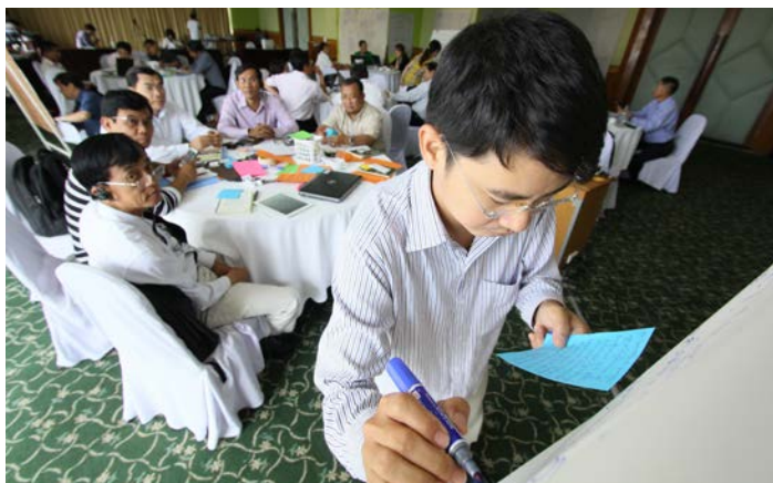
Figure 2: Sub-national officials at the RLG event share their experiences