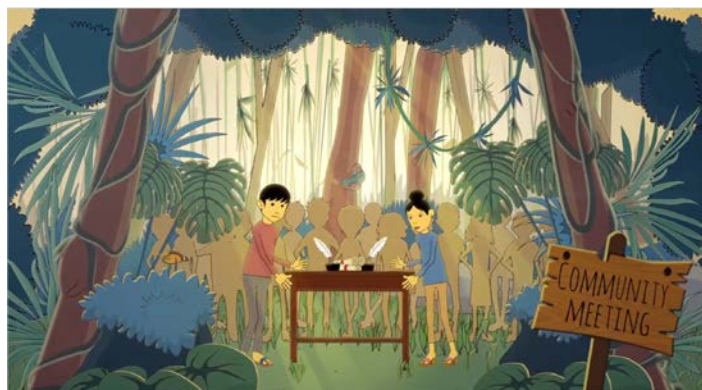
Figure 6: A still from the video. The video explains gender equity in context of community forests through animation.